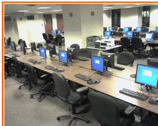
Large Document Review Room